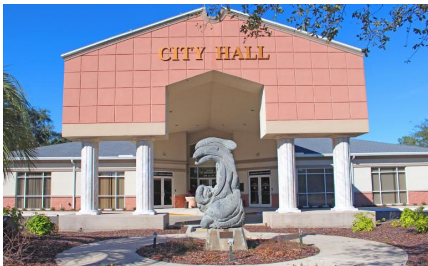
Entrance to St. Augustine Beach City Hall

Any further changes to the schedule will be posted on the City's website, Facebook, and on the City Hall doors.