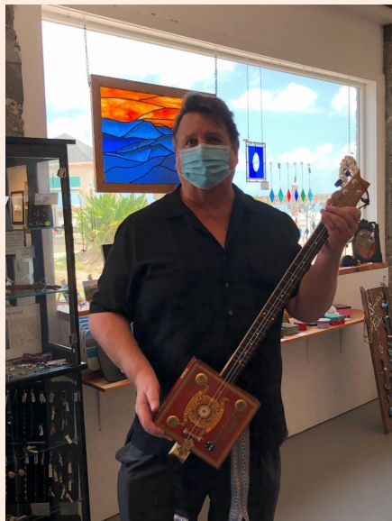
Pictured Top Left: Art Studio front entrance. "Dancers" by Enzo Torcoletti.

The Art Studio is open daily from 12:00 P.M. – 5:00 P.M. and can be reached at 904-295-4428. Visit them online at www.beachartstudio.org and on Facebook at The Art Studio.