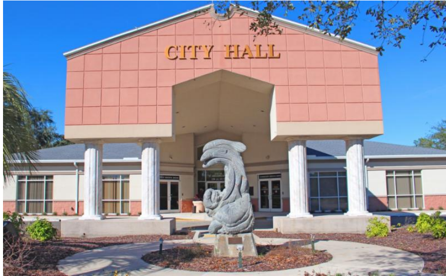
Entrance to St. Augustine Beach City Hall

During the week of the holiday, there will be no change to the special waste and recycling pickup schedule.