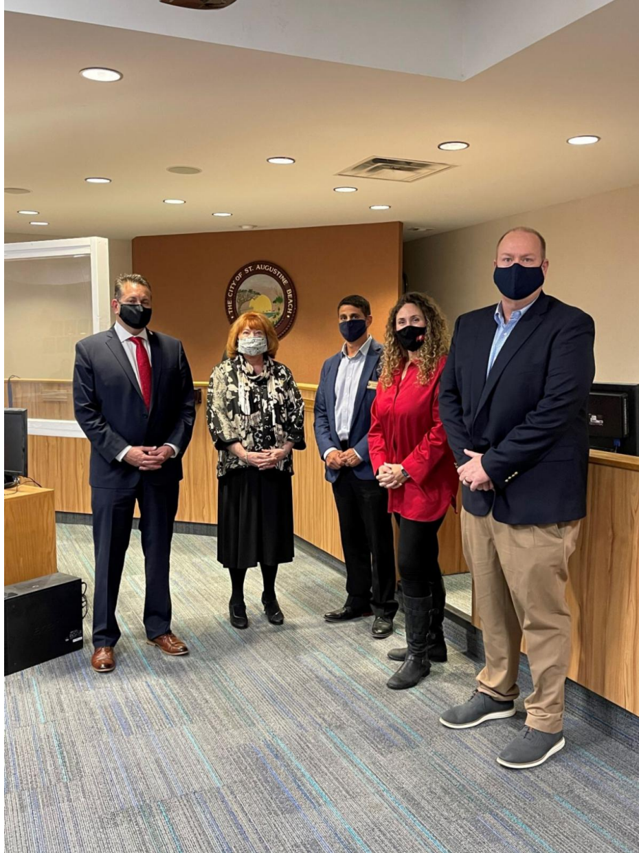
Pictured above: Commissioner Ernesto Torres, Mayor Margaret England, Vice Mayor Don Samora, Commissioner Undine George and Commissioner Dylan Rumrell.

The City of St. Augustine Beach elected its Mayor, Vice Mayor and swore in two Commissioners.