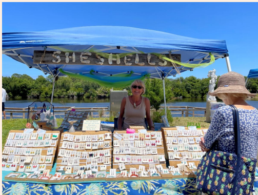
Left: SheShells jewelry had a great day at the Fair!