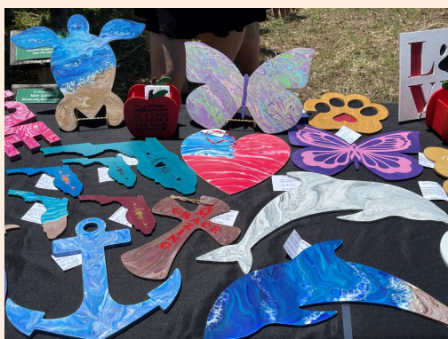
Left: Splatter and Pour sold unique art at the Fair.