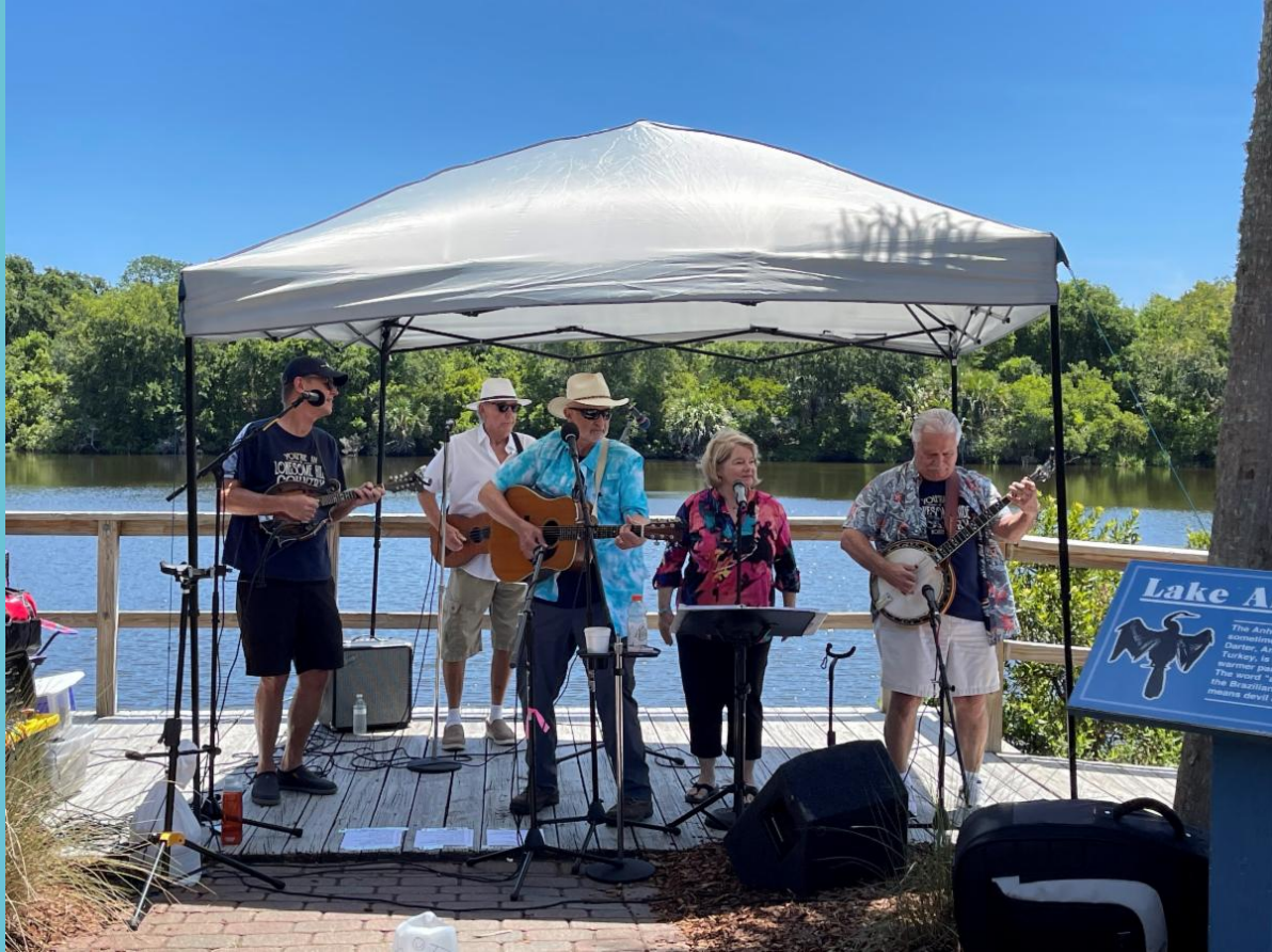
Above: Bluegrass Band, Lonesome Ride performed three amazing sets for the Fair attendees!