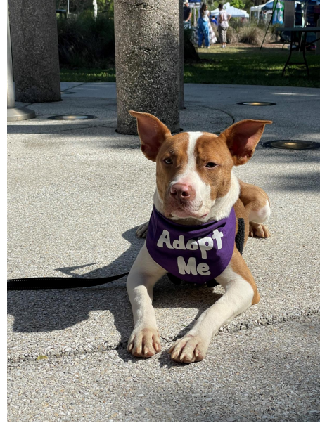
Above: Cadburry - Swamp Haven